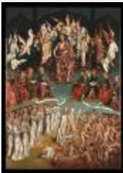
K2027 Fernando Gallego and Workshop The Last Judgment University of Arizona Museum of Art, Tucson, Arizona

Note: Purchased with 25 other paintings for $125,000.