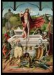
K2026 Maestro Bartolomé The Resurrection University of Arizona Museum of Art, Tucson, Arizona

Note: Purchased with 25 other paintings for $125,000.