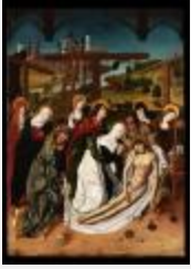
K2025 Maestro Bartolomé The Deposition University of Arizona Museum of Art, Tucson, Arizona