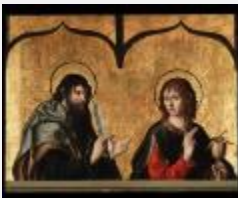
K2029 Fernando Gallego Saints Bartholomew and John the Evangelist University of Arizona Museum of Art, Tucson, Arizona

Note: Purchased with 25 other paintings for $125,000.