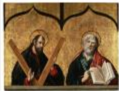
K2028 Fernando Gallego Saints Andrew and Peter University of Arizona Museum of Art, Tucson, Arizona

Note: Purchased with 25 other paintings for $125,000.