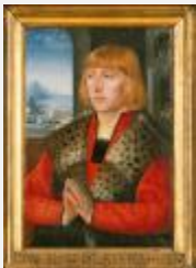
K6B Adriaen Isenbrant The Madonna and Child with a Member of the Hillensberger Family Lowe Art Museum, University of Miami, Coral Gables, Florida

Note: K6A and K6B purchased together for $10,000 K6A and K6B collectively credited $2,000. 6A and 6B credited $3000 as a pair.