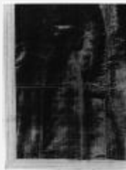
Anonymous Artist Green cut velvet cover, trimmed with gold galloon Metropolitan Museum of Art, New York, New York

Note: K6A and K6B purchased together for $10,000 6A and 6B collectively credited $2,000. 6A and 6B credited $3000 as a pair.