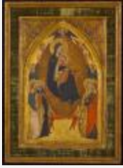
K44 Jacopo di Cione Madonna and Child in Glory with Saints and Angels Allentown Art Museum, Allentown, Pennsylvania