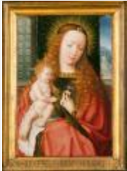
K6A Adriaen Isenbrant The Madonna and Child with a Member of the Hillensberger Family Lowe Art Museum, University of Miami, Coral Gables, Florida