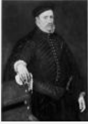
KX-1 Antonis Mor Portrait of a Man Unknown