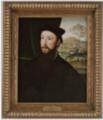
KX-3 Attributed to Giuliano Bugiardini Portrait of a Patrician Portland Art Museum, Portland, Oregon