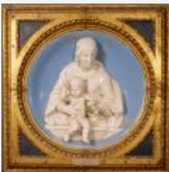
K35 Andrea della Robbia Madonna and Child Doris Ulmann Galleries, Berea College, Berea, KY