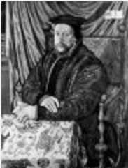
KX-2 Hans Muelich A Protestant Doctor of Laws Unknown