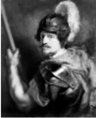
KX-5 Peter Paul Rubens Mars Unknown