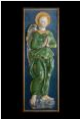
K155 Attributed to Giovanni della Robbia Angel in Adoration (Facing Left) Philbrook Museum of Art, Tulsa, Oklahoma

Note: K154 and K155 bought as a pair for $16,000.00.