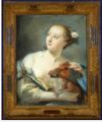
K151 Lorenzo Tiepolo Young Woman with a Parrot El Paso Museum of Art, El Paso, Texas