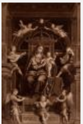
Bernardino Luini Madonna, Child, Saints, etc. Unknown

Note: K154 and K155 bought as a pair for $16,000.00.