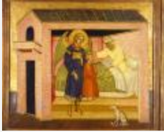
K153 Angelo Puccinelli Tobit Blessing His Son, Tobias, Accompanied by Archangel Raphael Philbrook Museum of Art, Tulsa, Oklahoma

Note: K150 and K151 bought as a pair for $50,000.00. Credited $5,000 as a pair on 6/27/34 (credit transferred from K153). K150 and K151 credited $5,000 as a pair on according to 7/15/1931 bill of sale (credit transferred from K153).