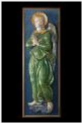
K154 Attributed to Giovanni della Robbia Angel in Adoration (Facing Right) Philbrook Museum of Art, Tulsa, Oklahoma

Note: Credit transfer from K153 to K150 and K151 noted on 7/15/1931 bill of sale.