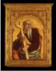
K336C Carlo Crivelli An Apostle Honolulu Museum of Art, Honolulu, Hawaii

Note: K336 A, B, and C purchased together for $9,000.