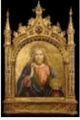
K336B Carlo Crivelli Christ Blessing (or The Savior Blessing) El Paso Museum of Art, El Paso, Texas