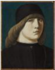
K338 Follower of Bartolomeo Vivarini Portrait of a Boy Allentown Art Museum, Allentown, Pennsylvania