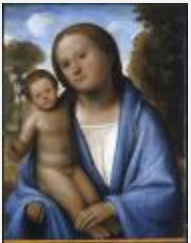
K337 Bramantino Madonna and Child Museum of Art and Archaeology, University of Missouri, Columbia, Missouri

Note: K336 A, B, and C purchased together for $9,000.