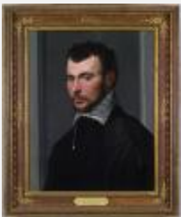
K339 Francesco Salviati Portrait of a Young Man Honolulu Museum of Art, Honolulu, Hawaii