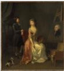
K1599 French 18th Century Portrait of an Artist in her Studio Jane Voorhees Zimmerli Art Museum, Rutgers, The State University of New Jersey, New Brunswick, New Jersey