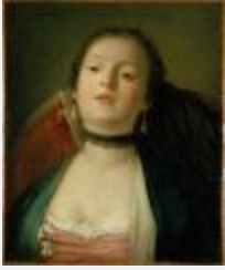
K1590 Pietro Rotari Young Woman with a Sprig of Jasmine Museum of Art and Archaeology, University of Missouri, Columbia, Missouri