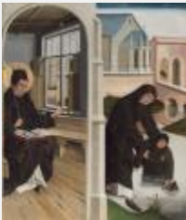
K1597 French 15th Century A Miracle of Saint Benedict National Gallery of Art, Washington, District of Columbia

Note: Purchase information source: Complete Catalogue of the Samuel H. Kress Collection, Phaidon Press, 1964-1977