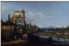
K1589 Bernardo Bellotto Capriccio with a Roman Arch Columbia Museum of Art, Columbia, South Carolina

Note: Purchase information source: Complete Catalogue of the Samuel H. Kress Collection, Phaidon Press, 1964-1977