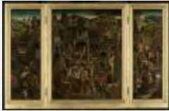
K1581 After Hans Memling The Passion of Christ Williams College Museum of Art, Williamstown, Massachusetts

Note: Purchase information source: Complete Catalogue of the Samuel H. Kress Collection, Phaidon Press, 1964-1977