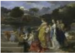
K1598 Sébastien Bourdon The Finding of Moses National Gallery of Art, Washington, District of Columbia

Note: Purchase information source: Complete Catalogue of the Samuel H. Kress Collection, Phaidon Press, 1964-1977