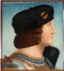
K1591 Bernardino de' Conti Charles d'Amboise Seattle Art Museum, Seattle, Washington

Note: Purchase information source: Complete Catalogue of the Samuel H. Kress Collection, Phaidon Press, 1964-1977