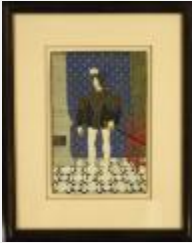
K1596 Jean Clouet Portrait of the Dauphin Henry Sheldon Museum of Art, University of Nebraska-Lincoln, Lincoln, Nebraska

Note: Purchase information source: Complete Catalogue of the Samuel H. Kress Collection, Phaidon Press, 1964-1977