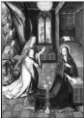
K1592 Flemish Master The Annunciation Unknown

Note: Purchase information source: Complete Catalogue of the Samuel H. Kress Collection, Phaidon Press, 1964-1977