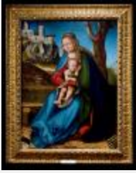
K1595 Lucas Cranach the Elder Virgin and Child University of Arizona Museum of Art, Tucson, Arizona