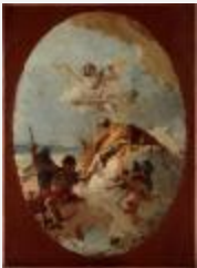
K1588 Giovanni Battista Tiepolo The Triumph of Valor Over Time Seattle Art Museum, Seattle, Washington

Note: Purchase information source: Complete Catalogue of the Samuel H. Kress Collection, Phaidon Press, 1964-1977