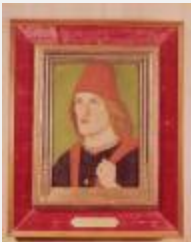
K1593 South German Master Young Man in a Red Cap Portland Art Museum, Portland, Oregon

Note: Purchase information source: Complete Catalogue of the Samuel H. Kress Collection, Phaidon Press, 1964-1977