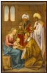
K1594 Hans Süß von Kulmbach Adoration of the Magi Allentown Art Museum, Allentown, Pennsylvania

Note: Purchase information source: Complete Catalogue of the Samuel H. Kress Collection, Phaidon Press, 1964-1977