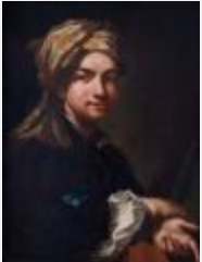
K1586 Martin van Mytens the Younger Self-Portrait Fairfield University Art Museum, Fairfield, Connecticut

Note: Purchase information source: Complete Catalogue of the Samuel H. Kress Collection, Phaidon Press, 1964-1977