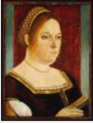
K1585 Vittore Carpaccio Portrait of a Woman Holding a Book Denver Art Museum, Denver, Colorado