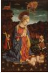
K1580 Giovanni Francesco da Rimini Madonna Adoring the Christ Child High Museum of Art, Atlanta, Georgia