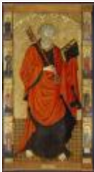
K1582 Aragonese Master or Valencian Master Saint Peter Birmingham Museum of Art, Birmingham, Alabama

Note: Purchase information source: Complete Catalogue of the Samuel H. Kress Collection, Phaidon Press, 1964-1977