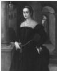
K1098 Attributed to Ridolfo Ghirlandaio Portrait of a Young Lady Haggin Museum, Stockton, California