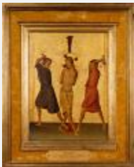
K197 Master of San Martino Alla Palma The Flagellation Doris Ulmann Galleries, Berea College, Berea, KY