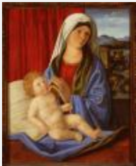
K1027 Cristoforo Caselli Madonna and Child High Museum of Art, Atlanta, Georgia