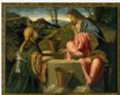
K1006 Vincenzo Catena Christ and the Samaritan Woman Columbia Museum of Art, Columbia, South Carolina