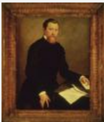
K359 Giovanni Battista Moroni Portrait of a Man Honolulu Museum of Art, Honolulu, Hawaii