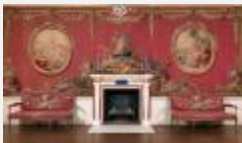
Room after a design by Robert Adam Tapestry Room from Croome Court Metropolitan Museum of Art, New York, New York