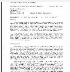
K1855 - Examination summary and treatment proposal, 1990