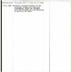
K1311 - Work summary log, 1944-1948