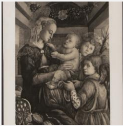
K1311 - Expert opinion by Berenson, 1945