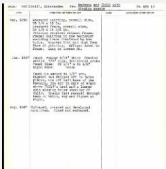
K1311 - Work summary log, 1946-1947