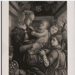
K1311 - Art object record, circa 1930s-1950s