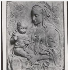
K1251 - Art object record, circa 1930s-1950s