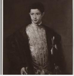
K1562 - Expert opinion by Longhi, 1948