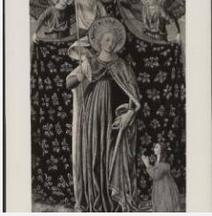
K0482 - Expert opinion by Fiocco, 1938