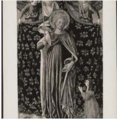
K0482 - Expert opinion by Suida, 1938