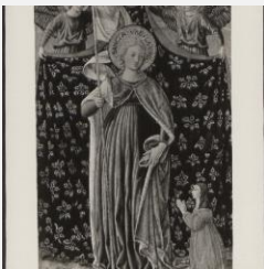
K0482 - Art object record, circa 1930s-1950s