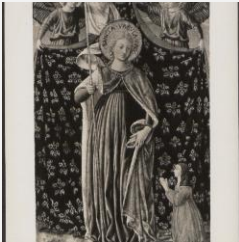
K0482 - Expert opinion by A. Venturi, circa 1920s-1930s