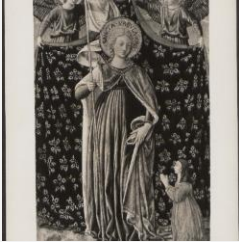
K0482 - Expert opinion by Perkins, circa 1920s-1940s