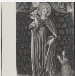
K0482 - Expert opinion by Berenson, circa 1920s-1950s