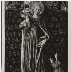
K0482 - Expert opinion by Berenson, circa 1920s-1950s