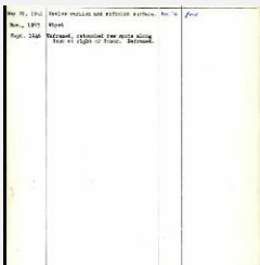
K0482 - Work summary log, 1941-1946