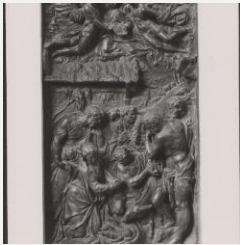
K1044 - Expert opinion by Suida, 1936