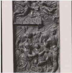
K1044 - Expert opinion by A. Venturi, 1936