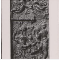
K1044 - Expert opinion by Fiocco, 1936