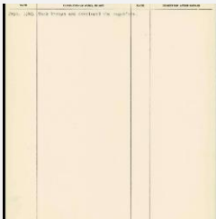
K1422 - Work summary log, 1963