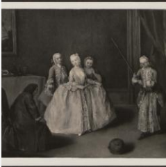
K0147 - Expert opinion by A. Venturi, 1936