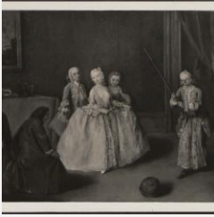
K0147 - Expert opinion by Fiocco, 1936