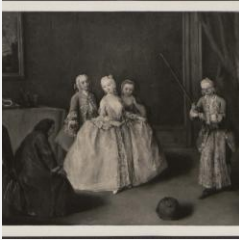
K0147 - Expert opinion by Suida, 1936