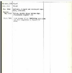
K0147 - Work summary log, 1943-1969