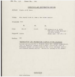
K1684 - Condition and restoration record, circa 1950s-1960s