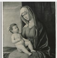
K1069 - Photograph, circa 1930s-1960s