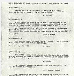
K1069 - Expert opinion by Fiocco et al., circa 1930s-1940s