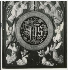
K1071 - Art object record, circa 1930s-1950s