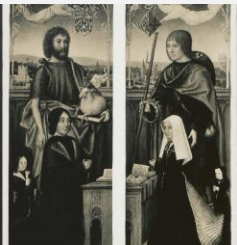
K1071 - Photograph, circa 1930s-1960s