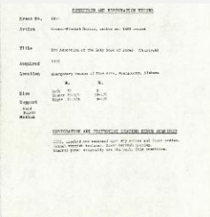
K1071 - Condition and restoration record, circa 1950s-1960s