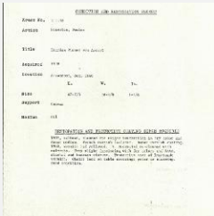
K1132 - Condition and restoration record, circa 1950s-1960s