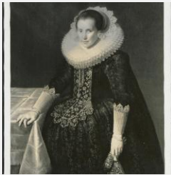
K1132 - Photograph, circa 1930s-1960s