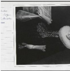
K1132 - National Gallery of Art mounted photograph, circa 1940s-1950s