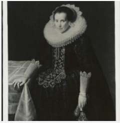
K1132 - Photograph, circa 1930s-1960s