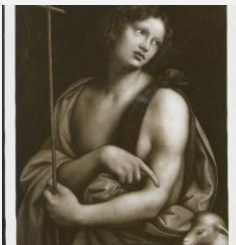
K1159 - Expert opinion by Suida, 1938