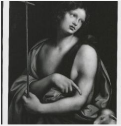
K1159 - Photograph, circa 1930s-1960s