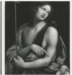
K1159 - Expert opinion by Fiocco, 1938