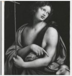
K1159 - Art object record, circa 1930s-1950s