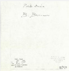
K1165 - Expert opinion by Berenson, circa 1920s-1950s