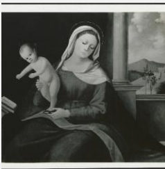
K1165 - Photograph, circa 1930s-1960s