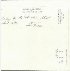
K0122 - Expert opinion by Fiocco, circa 1930s-1940s