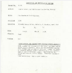
K0122 - Condition and restoration record, circa 1950s-1960s