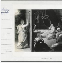
K0122 - National Gallery of Art mounted photograph, circa 1940s-1950s