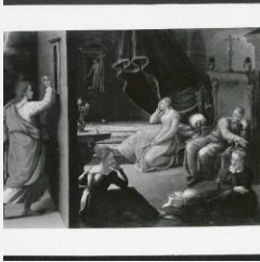
K0122 - Photograph, circa 1930s-1960s