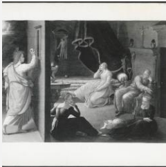
K0122 - Photograph, circa 1930s-1960s