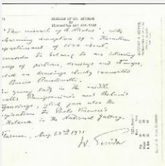
K0122 - Expert opinion by Suida, 1935