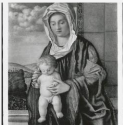
K1269 - Photograph, circa 1930s-1960s