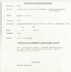
K1269 - Condition and restoration record, circa 1950s-1960s