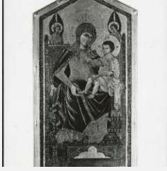
K1301 - Art object record, circa 1930s-1950s