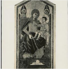
K1301 - Photograph, circa 1930s-1960s