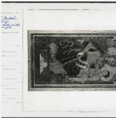
K1301 - National Gallery of Art mounted photograph, circa 1940s-1950s