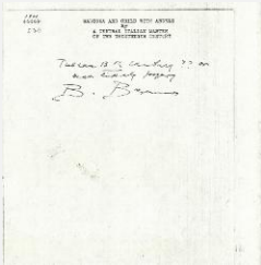
K1301 - Expert opinion by Berenson, circa 1920s-1950s