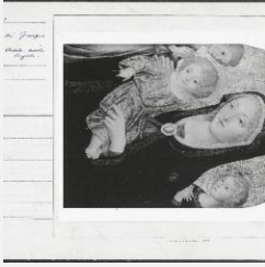
K1370 - National Gallery of Art mounted photograph, circa 1940s-1950s