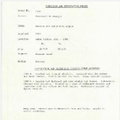
K1370 - Condition and restoration record, circa 1950s-1960s