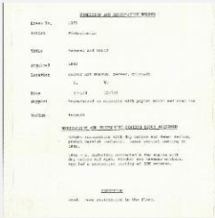
K1375 - Condition and restoration record, circa 1950s-1960s