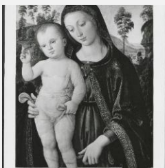
K1375 - Photograph, circa 1930s-1960s