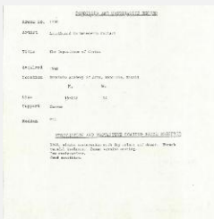
K1538 - Condition and restoration record, circa 1950s-1960s