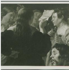
K1542 - Photograph, circa 1930s-1960s