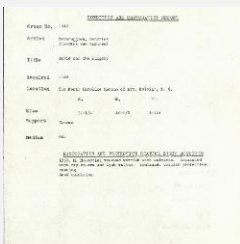
K1542 - Condition and restoration record, circa 1950s-1960s