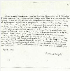
K1551 - Expert opinion by Longhi, 1948