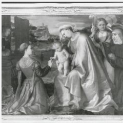
K1551 - Photograph, circa 1930s-1960s