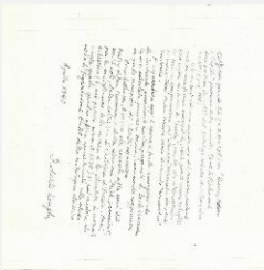
K1552 - Expert opinion by Longhi, 1948