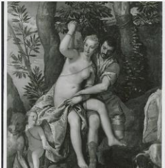
K1552 - Photograph, circa 1930s-1960s