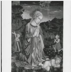
K1580 - Photograph, circa 1930s-1960s