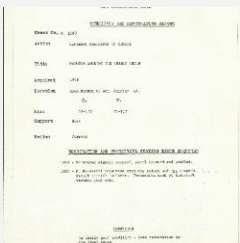
K1580 - Condition and restoration record, circa 1950s-1960s