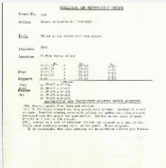
K1584 - Condition and restoration record, circa 1950s-1960s