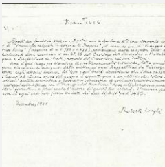
K1616 - Expert opinion by Longhi, 1948