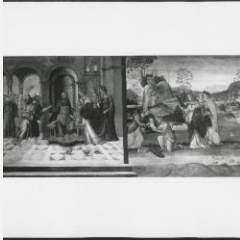
K1616 - Photograph, circa 1930s-1960s