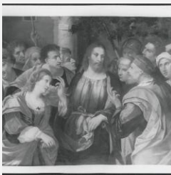
K1629 - Photograph, circa 1930s-1960s