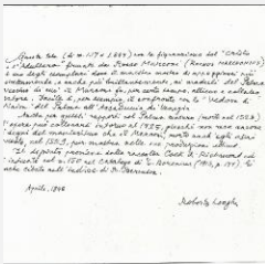
K1629 - Expert opinion by Longhi, 1948