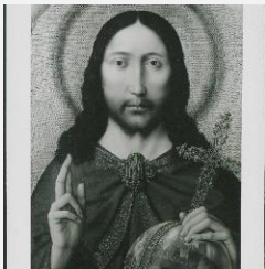
K1688 - Photograph, circa 1930s-1960s