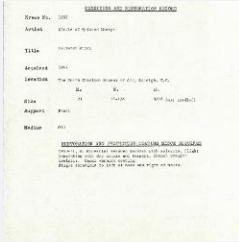
K1688 - Condition and restoration record, circa 1950s-1960s