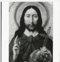
K1688 - Photograph, circa 1930s-1960s