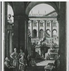
K1691 - National Gallery of Art mounted photograph, circa 1940s-1950s