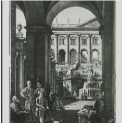
K1691 - Photograph, circa 1930s-1960s