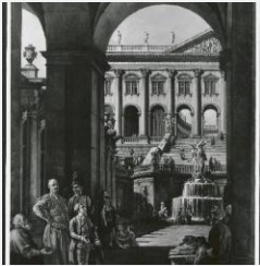
K1691 - Photograph, circa 1930s-1960s