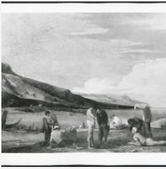
K1692 - Photograph, circa 1930s-1960s