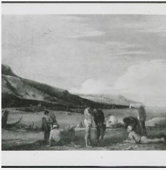
K1692 - Photograph, circa 1930s-1960s