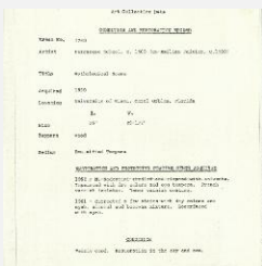
K1748 - Condition and restoration record, circa 1950s-1960s