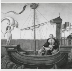
K1748 - Photograph, circa 1930s-1960s