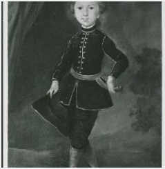
K1757 - Photograph, circa 1930s-1960s