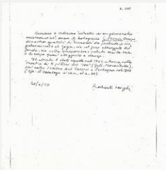
K1757 - Expert opinion by Longhi, 1950