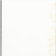
K1768 - Photograph, circa 1930s-1960s