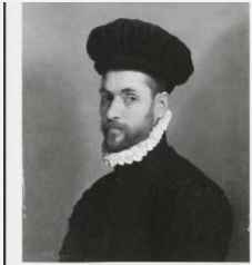
K1768 - Photograph, circa 1930s-1960s