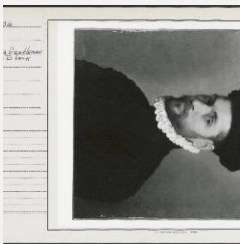
K1768 - National Gallery of Art mounted photograph, circa 1940s-1950s