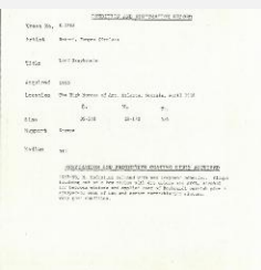
K1785 - Condition and restoration record, circa 1950s-1960s