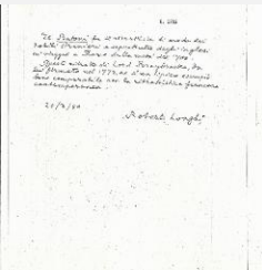
K1785 - Expert opinion by Longhi, 1950