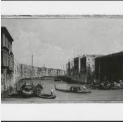
K1806 - Photograph, circa 1930s-1960s