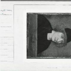
K1825 - National Gallery of Art mounted photograph, circa 1940s-1950s