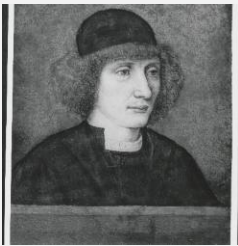
K1825 - Photograph, circa 1930s-1960s