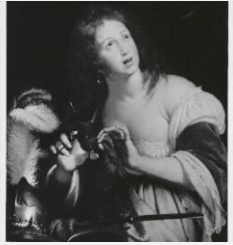
K1879 - Photograph, circa 1930s-1960s