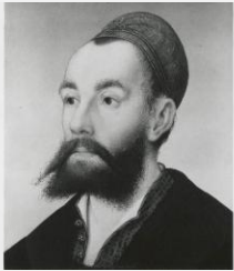
K1886 - Photograph, circa 1930s-1960s